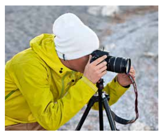
Tech Details 1/10 sec. at f / 9, ISO 400 Lens EF70-200mm f/2.8L IS II USM Filter Singh Ray 2-stop soft step Grad ND Manfrotto Befree Tripod