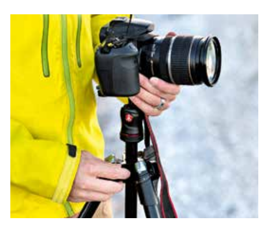
Tech Details 1/60 sec. at f / 11, ISO 160 Lens EF70-200mm f/2.8L IS II USM Filter Singh Ray 2-stop Hard step Grad ND Manfrotto BeFree Tripod