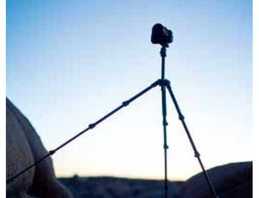
Tech Details 10 sec. at f / 4.0, ISO 2000 Lens EF24mm f/1.4L II USM Manfrotto Befree Tripod