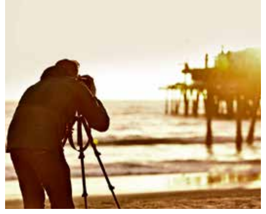
Tech Details 1/8 sec. at f / 5.6, ISO 400 Lens TS-E 24mm f/3.5L II Manfrotto Befree Tripod