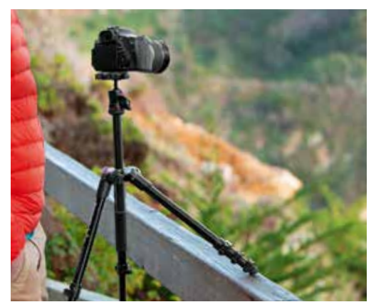
Tech Details .8 sec. at f / 18, ISO 100 Lens EF24-105mm f/4L IS USM Filter Singh Ray LB Warmin Polarizer Manfrotto Befree Tripod