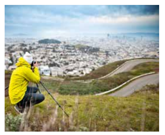
Tech Details 30 sec. at f / 13, ISO 160 Lens EF24-105mm f/4L IS USM Filter Singh Ray 2-stop Reverse Grad ND Manfrotto Befree Tripod